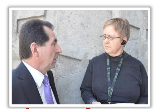
FIRST COUNSEL AND TEAM MEMBER TO BRING A CLIENT TO THE VIC

This led the Provincial Court, with other members of the justice system, to initiate dialogue with the agencies supporting the ACT teams and to explore the idea of working with the teams to implement an integrated court in Victoria