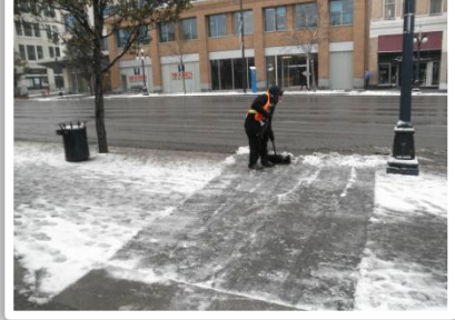
COMMUNITY WORK SERVICE BEING PERFORMED

work and to update the court on community service that has been performed by an offender.