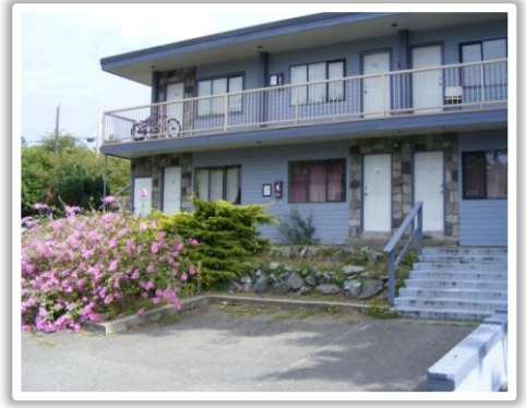
LOW BARRIER HOUSING

with developmental disabilities. CLBC assists these individuals with building social and life skills, connecting to appropriate housing, and obtaining employment. Under its umbrella, CLBC funds a Community Response Team which provides support to those adults with developmental disorders who demonstrate extreme behaviours, psychiatric disorders and/or have critical health needs. CLBC also offers the Personalized Support Initiative, a program that provides specific supports to individuals with a diagnosis of Fetal Alcohol Syndrome Disorder or Autism Spectrum Disorder who have significant limitations in adaptive functioning. Services provided by CLBC may