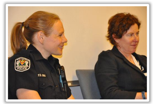
POLICE AND CROWN COUNSEL IN PRE-COURT PLANNING MEETING