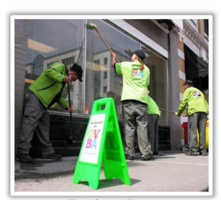
THE CLEAN TEAM

Everyone involved believes strongly in the importance of community work service as a means for offenders to make reparation to the community, and as a way of assisting them in gaining the experience necessary for increased self-esteem and potential employment opportunities. The Clean Team<sup>7</sup> has provided successful placements for a number of offenders whose sentences included performing services for the community. Among other projects, the sub-committee is exploring the feasibility of a mural in the downtown core.