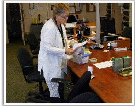
VICOT MEMBER GATHERING MEDICATIONS FOR CLIENTS