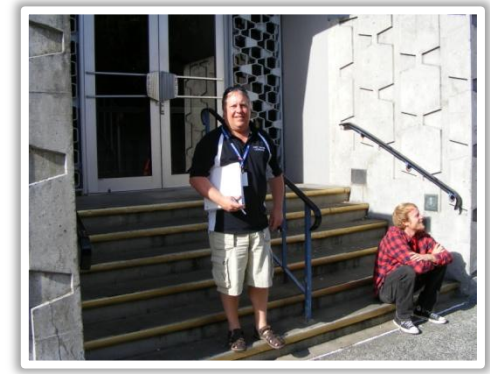
TEAM MEMBERS OUTSIDE THE COURTHOUSE

The court then hears from defence counsel concerning any additional relevant information about the offender's background and any mitigating circumstances regarding the offence.